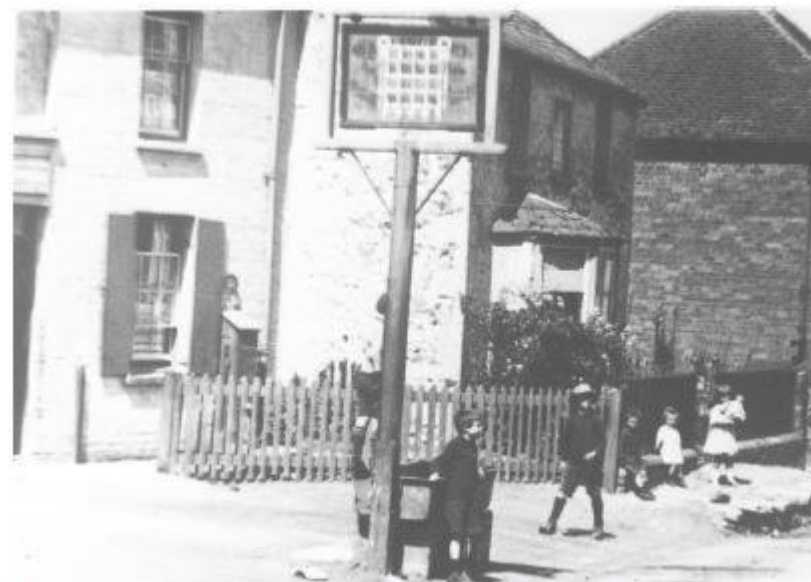
The Catherine Wheel pre WW2. The building between the pub and no 24 Henley Road was a shop